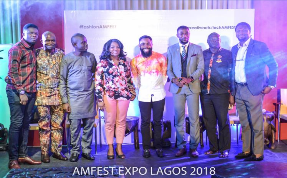
AMFEST EXPO LAGOS 2018