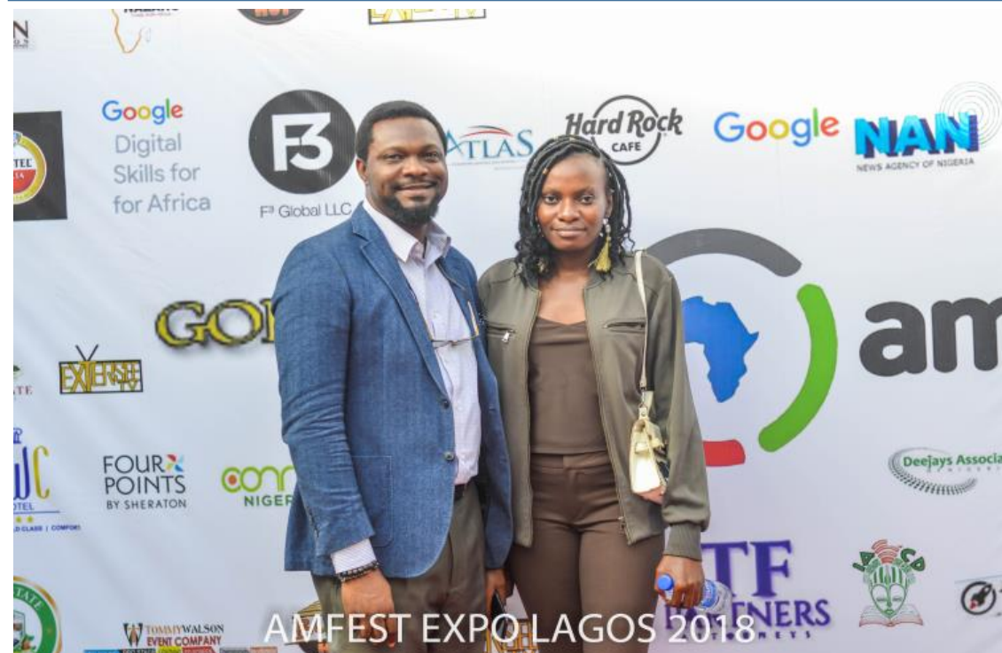
AMFEST EXPO LAGOS 2018