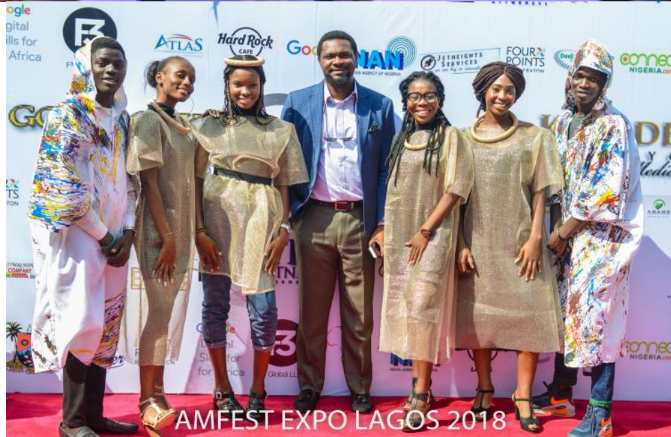
AMFEST EXPO LAGOS 2018