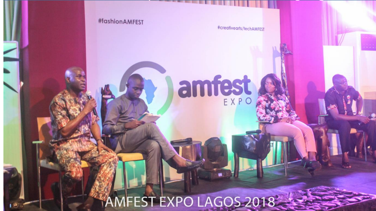
AMFEST EXPO LAGOS 2018