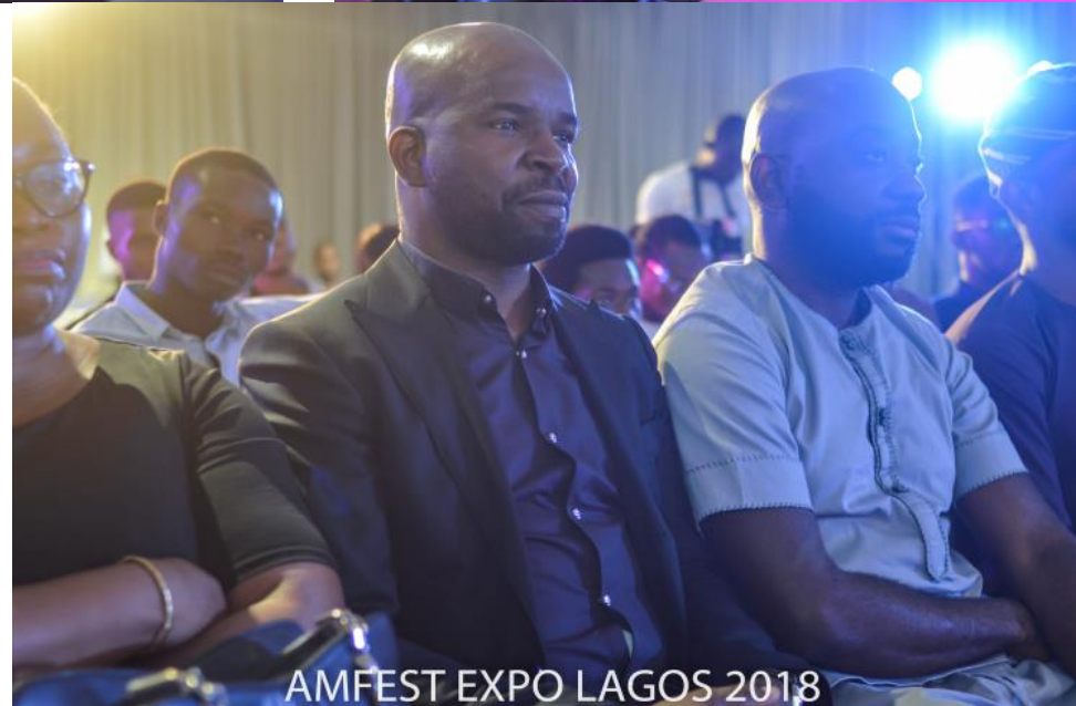
AMFEST EXPO LAGOS 2018