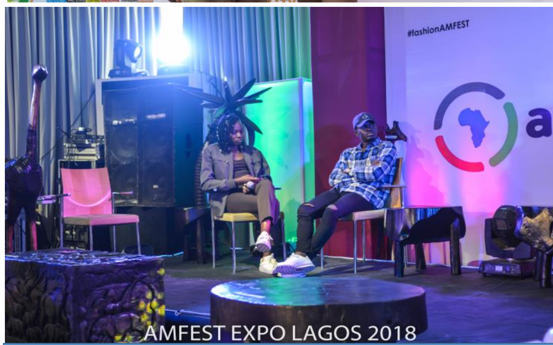
AMFEST EXPO LAGOS 2018