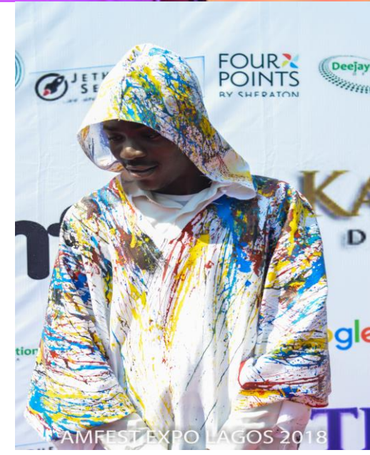
AMFEST EXPO LAGOS 2018