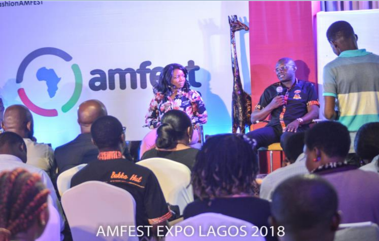
AMFEST EXPO LAGOS 2018