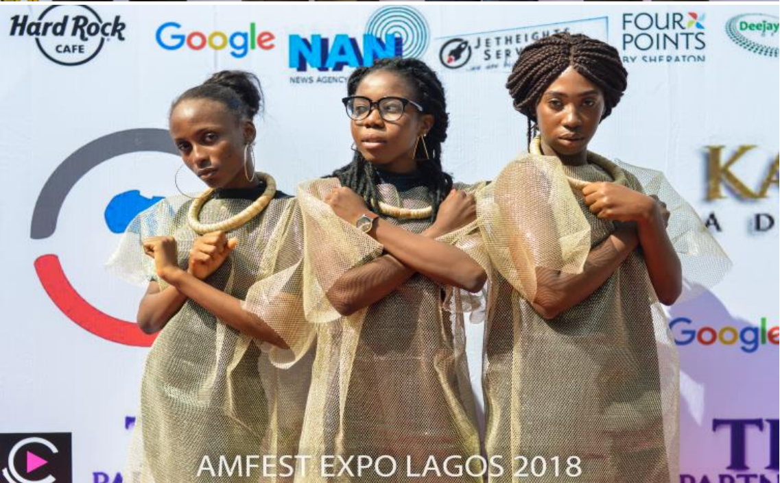
AMFEST EXPO LAGOS 2018