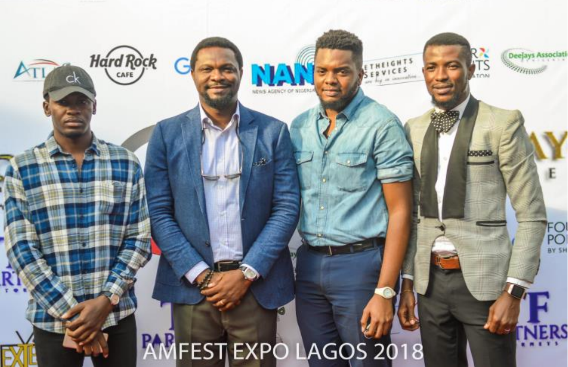
AMFEST EXPO LAGOS 2018