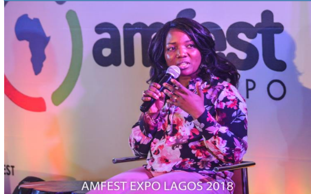
AMFEST EXPO LAGOS 2018